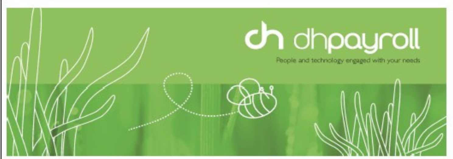
Let us lead you in the right direction...

With over 20 years of experience within direct payments,